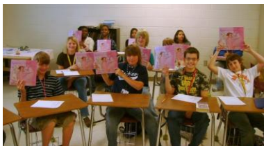
Above: Student ready to write with their Katherine’s Quilt books.